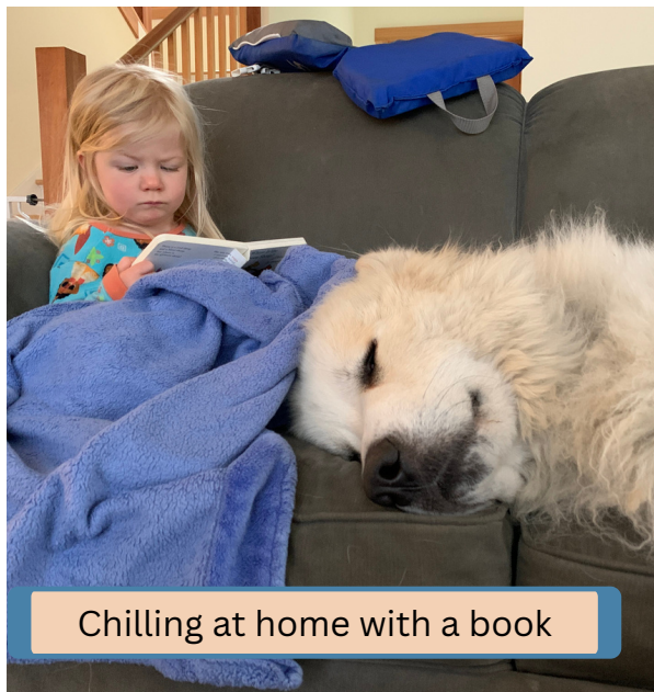
Chilling at home with a book