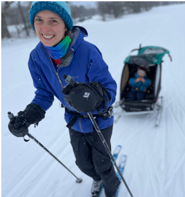
Cross Country Skiing