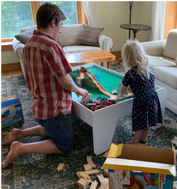
Playing with our train set