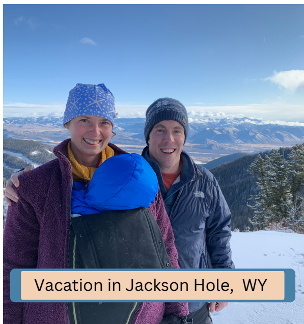
Vacation in Jackson Hole, WY