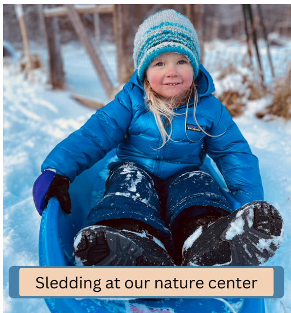
Sledding at our nature center