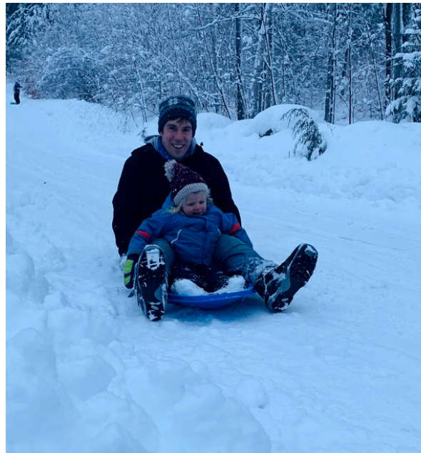
Sledding at our friend's house