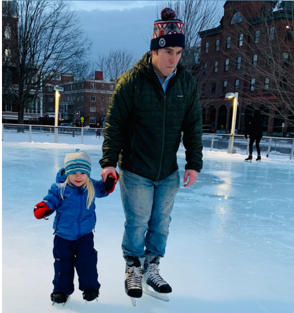
Skating at our town rink